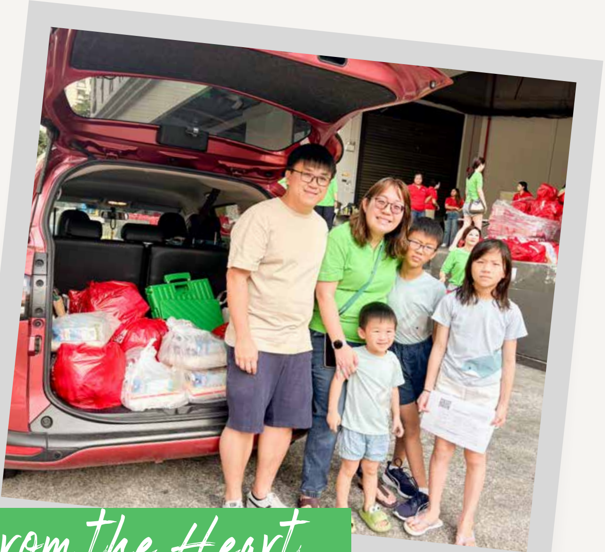
Food from the Heart

was raised for BHF by close to 500 employees at our NFC Day Out