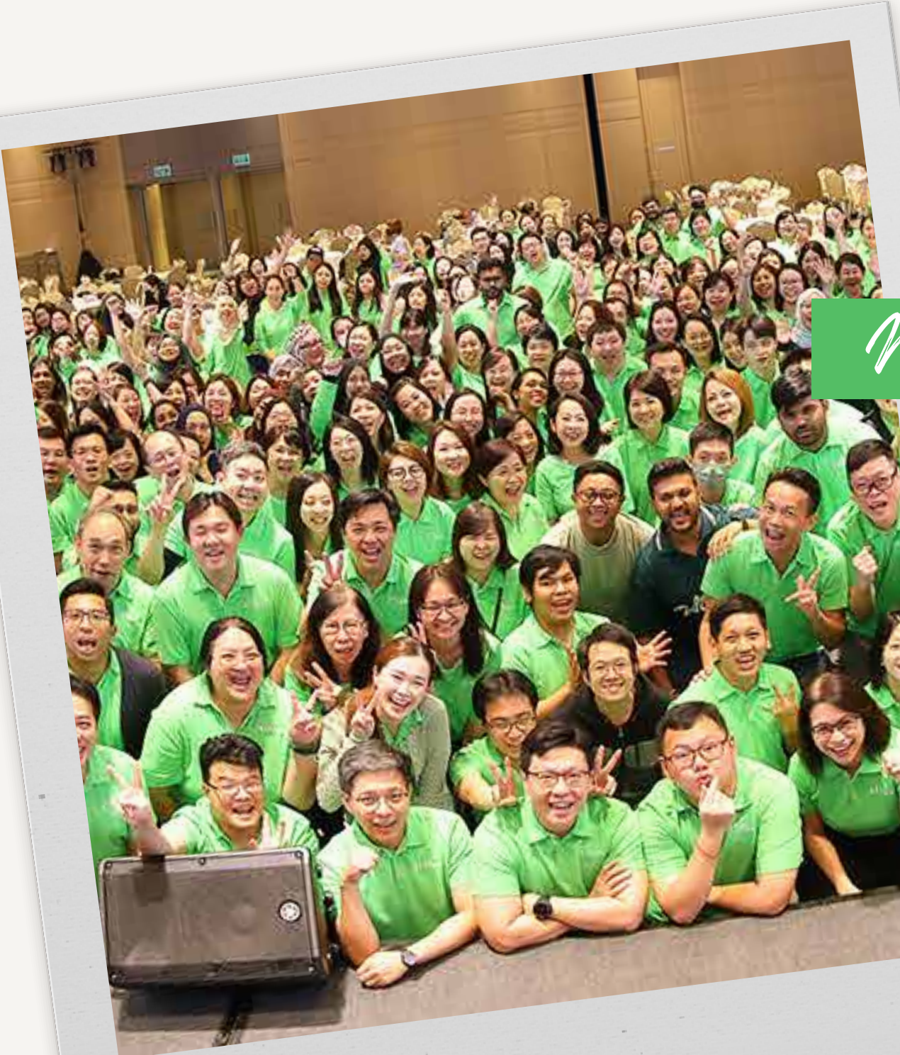
NFC Day Out